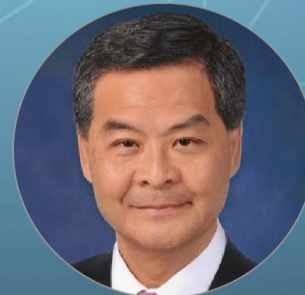
LEUNG Chun Ying Vice Chairman, National Committee of the CPPCC